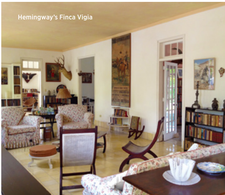
Hemingway's Finca Vigia