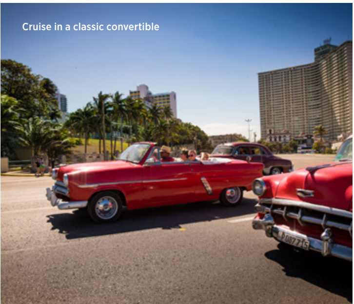
Cruise in a classic convertible

Baroque nestles seamlessly next to Gaudí-inspired art nouveau. Continue to Plaza de San Francisco which faces Havana harbor.