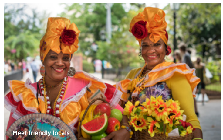
Meet friendly locals

Since a cigar isn't complete without a humididor to properly store it, we'll head to the private enterprise workshop, Humidores Havana , that creates humidors for the international cigar market. You'll be